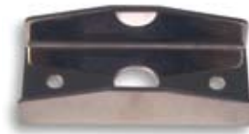
OJ10-1200-00 Brush Guard