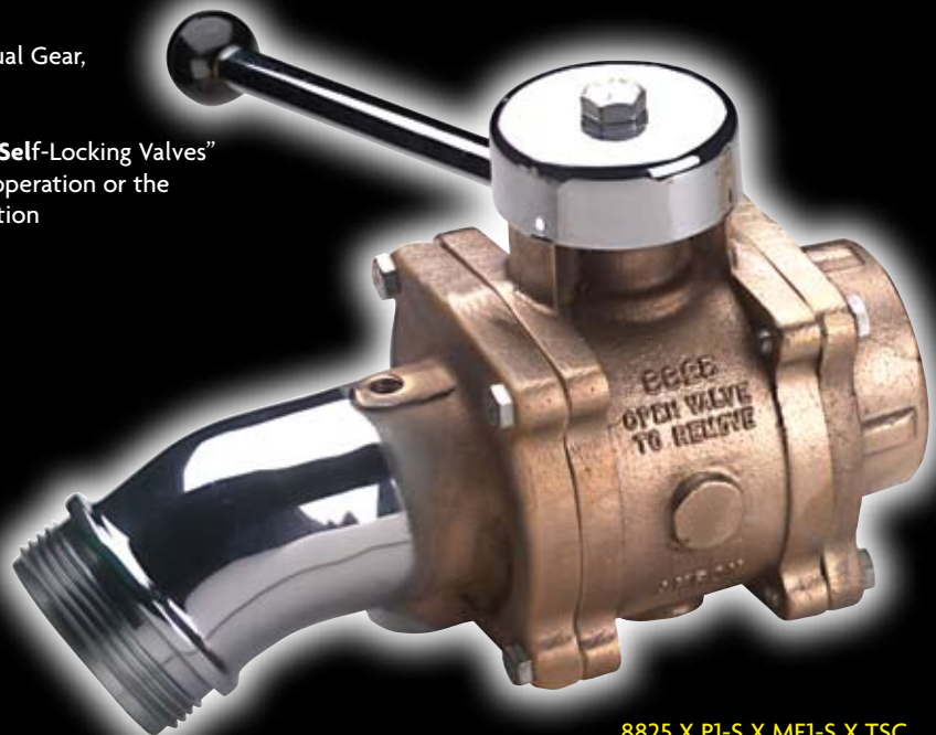
8825 X P1-S X ME1-S X TSC